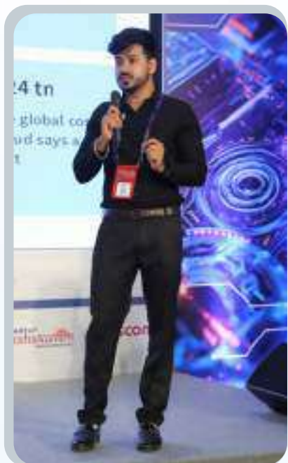
The pavilion showcased dynamic panel discussions, delivering invaluable insights from industry leaders under the expert moderation. Attendees gleaned essential knowledge on IP frameworks and strategic protection, crucial for navigating the multifaceted landscape of innovation across diverse sectors.