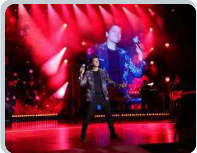
Live concert of Shaan on 18th March 2024