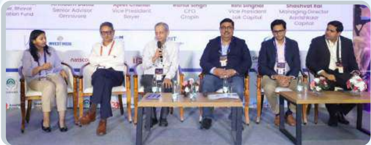
Investing in the future of agriculture: emerging trends and innovations in Agritech - The session was focused on the transformative role of agritech in driving innovation and sustainability in the agricultural sector.