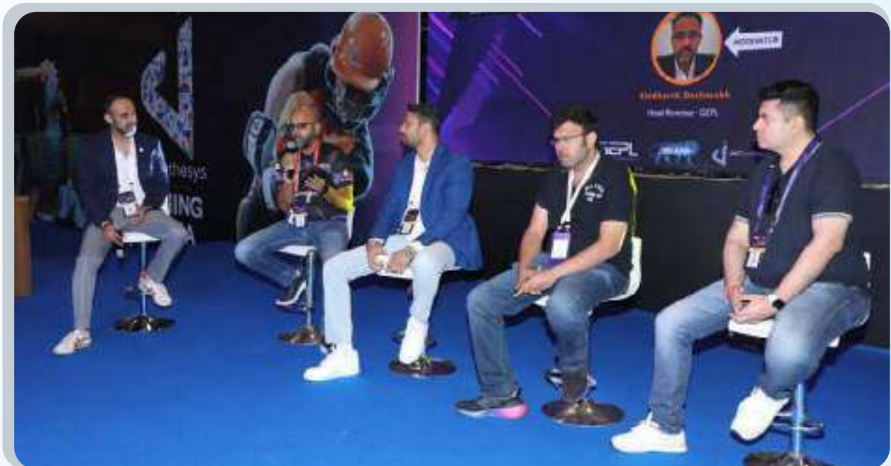
Impact of GEPL on bridging the gap between gaming, e-cricket, and entertainment

Overall, the pavilion served as a vibrant hub that united gaming enthusiasts, professionals, and investors in the exciting world of gaming and esports. By celebrating the meteoric rise of esports in India and highlighting the opportunities and potential within the industry, the pavilion inspired attendees and reinforced the importance of fostering talent, promoting innovation, and supporting the growth of gaming and esports in India.