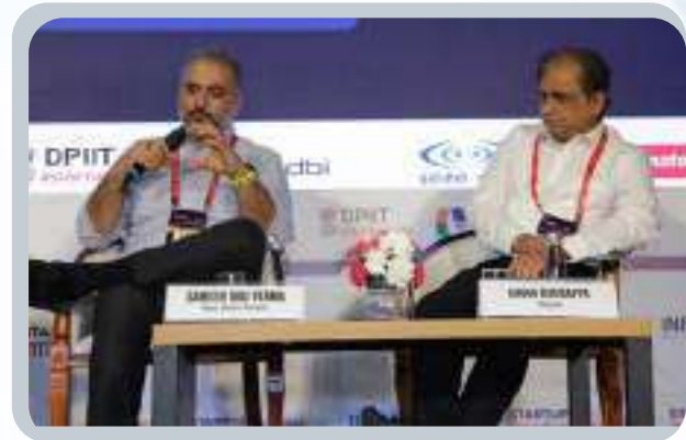
Whitespace in B2B and where can you build: The discussion explored whitespace opportunities in B2B, identifying areas where businesses can build and innovate.