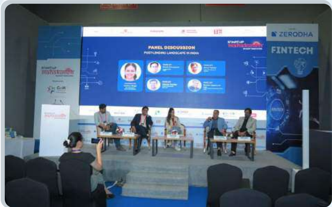
Post-Lending Landscape in India: The panel discussed the evolving post-lending landscape in India, exploring new trends, challenges, and opportunities shaping the financial sector.