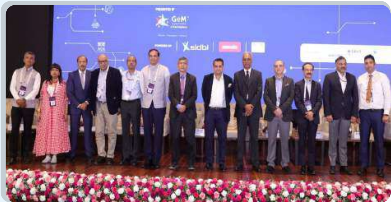
Startup Mahakumbh commenced its first day at Bharat Mandapam with a pivotal panel discussion on the role of startups in realizing the vision of Vikasit Bharat.