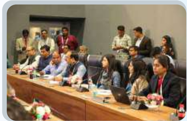
Angel Networks in Tier II & III towns-Access to capital for early-stage Incubators/ Startups