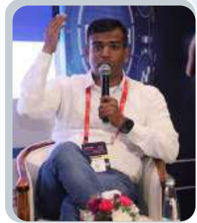
Looking ahead: The Opportunity in Fintech - The panel delved into the future prospects of fintech, highlighting the opportunities and potential for innovation in the evolving financial technology landscape.