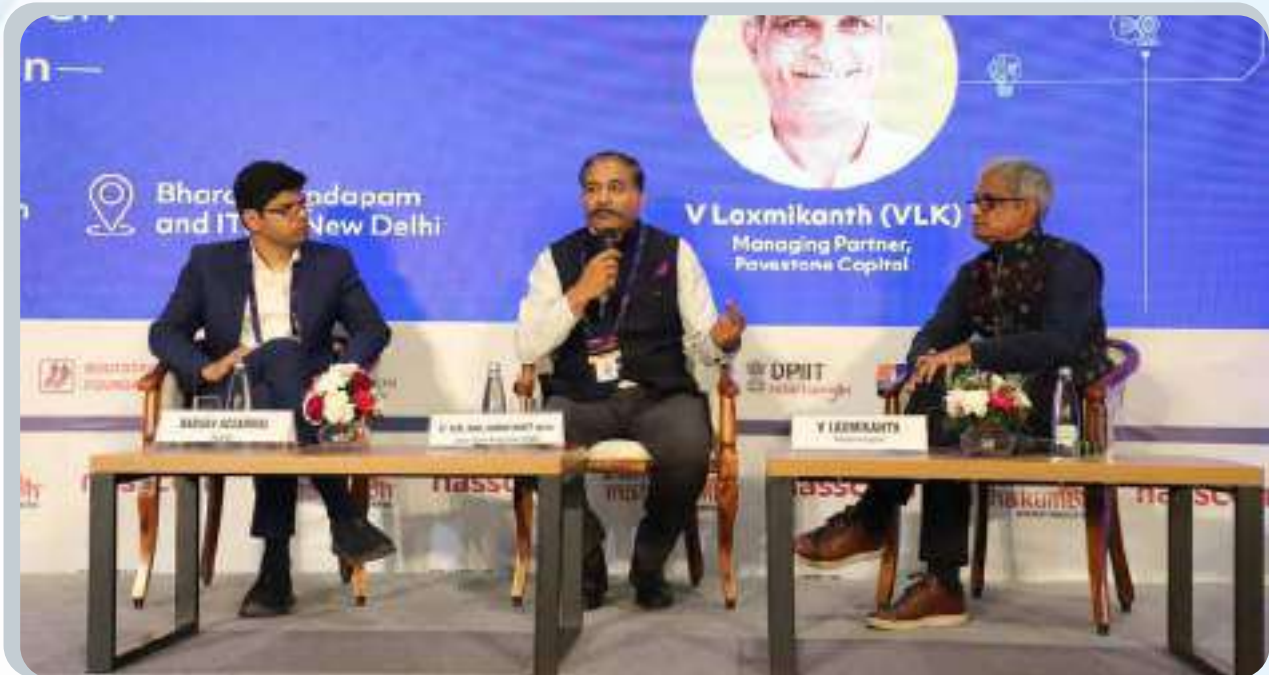
Rethinking Research Funding Models for DeepScience Advancements: The panel explored new approaches to research funding models for deep science advancements, emphasizing the need for innovative strategies to support and accelerate breakthrough discoveries.