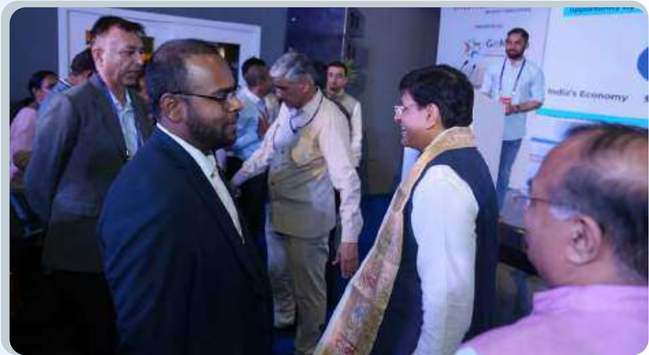
The winners of the 'AI for Public Good' contest, including eVerse. AI, B.A.E, and Bodhi, showcased AI-driven solutions tailored for India to address real problems.