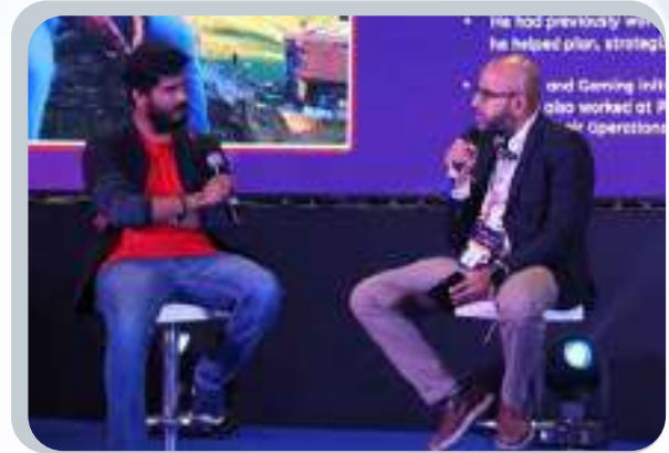
Level Up Your Future: A masterclass from industry experts on the Gaming and Esports Industry in India and what it takes to build a career out of your passion for gaming.