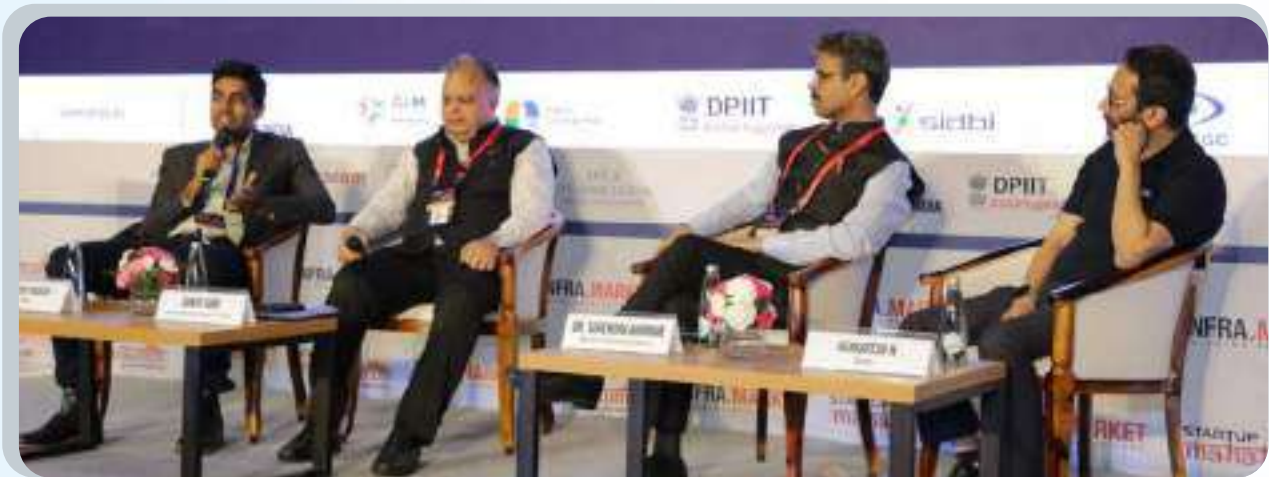
Innovations in logistics – the next decade: The discussion explored future innovations in logistics, highlighting effective working capital management and supply chain optimization for the next decade.