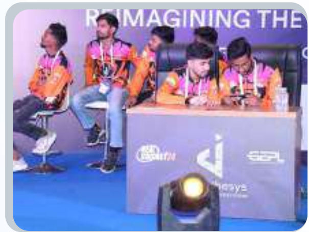
Tournament – Show match between Dubai Vipers & GEPL All-Stars