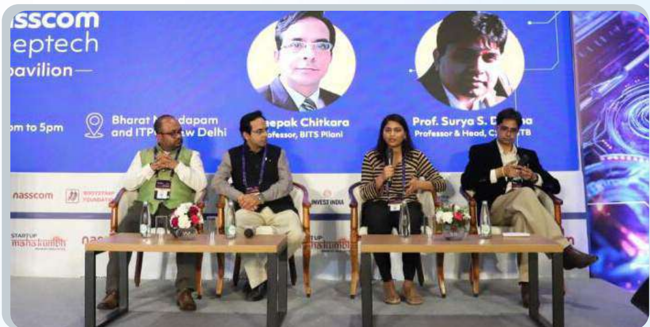
IP Protection & Technology Transfer: The panel discussed IP protection and technology transfer, highlighting strategies and best practices to safeguard intellectual property and facilitate successful technology transfer.