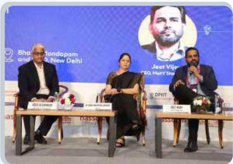
Commercialization for DeepTech Innovation: IP Framework: The panel discussed the commercialization of deeptech innovation, focusing on the importance of an effective Intellectual Property (IP) framework to support and protect innovations.