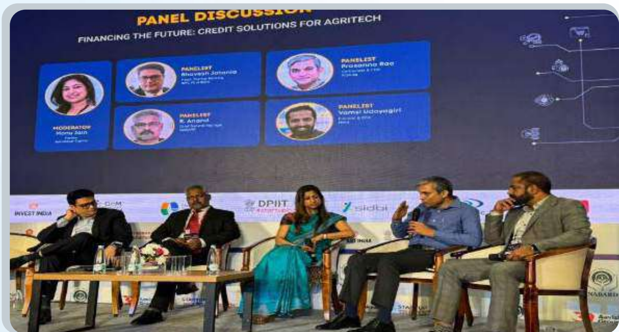
Financing the Future: Credit Solutions for Agritech - The panel discussion offered deep insights into tailored credit solutions for the agritech sector.