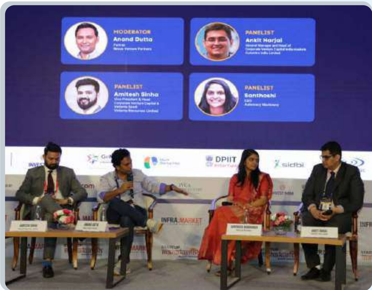
Future of Manufacturing: The session provided actionable advice and emphasized essential elements for thriving in India's dynamic and competitive business landscape.