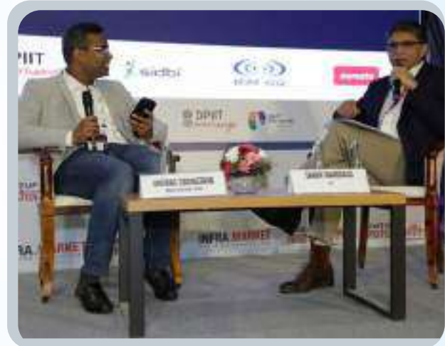
Evolution of brand in B2B: The discussion centered on the evolution of B2B brands, emphasizing understanding market dynamics and identifying niche opportunities to adapt and grow.