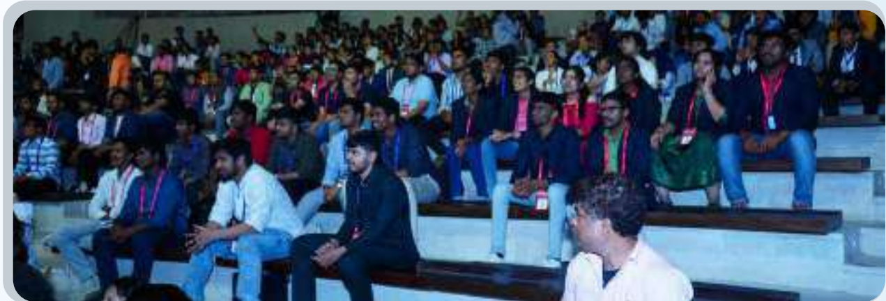
Live concert of Ricky Kej (3X Grammy Award Winner) on 19th March 2024