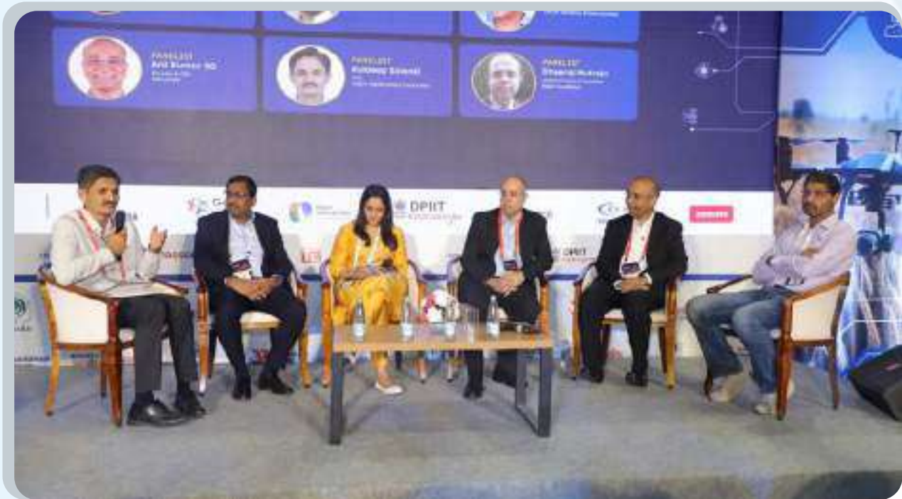
Cultivating synergies: An open house discussion on empowering agriculture through agri-techs and FPO collaborations.