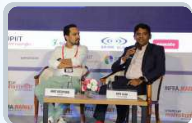
Effective management of your working capital: The discussion emphasized the importance of effective working capital management for sustaining business operations, optimizing liquidity, and supporting growth.