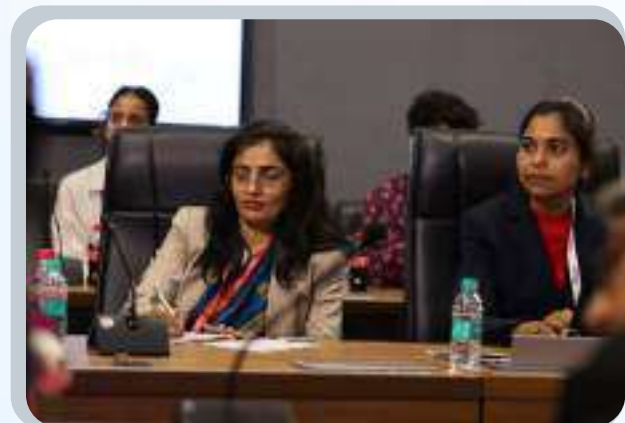
Roundtable on 'Leveraging Government and Public Sectors for Innovations & Entrepreneurship'