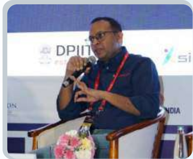
Post pandemic consumer trends and it's impact on internet economy: The session delved into post-pandemic consumer trends and their impact on the internet economy, highlighting shifts in online behavior and opportunities for businesses to adapt and thrive.