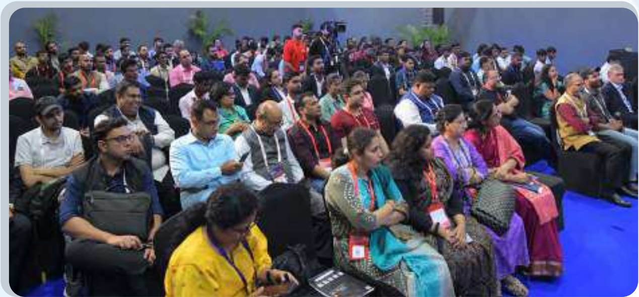
Roles of corporates for incubation and start-up ecosystem: CSR & innovation programs - The discussion explored the roles of corporates in the incubation and startup ecosystem, focusing on the impact of CSR and innovation programs in fostering growth and support.